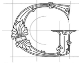
Grandjany Memorial Competition